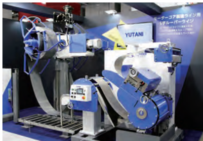
Development model announced at the exhibition

They have over 80 years of history as all-embracing manufacturer of feed device mainly coil line. At the time of founding, they were dealing with turning process and air tool repairing and started to develop current main products with the request of feed device of press as a starting point. They expand production of such press automated device such leveler feeder. Contribute to automation and efficiency of peripheral equipment of before and after processing, and they focus more on products for after processing such handling robots between presses recently. Shear line and slitters which cut such sheet copper for such coil center. Cut and stacking device for iron core of transformers, which they supply them to manufacturers of transformers and its suppliers, contributes to their performance in 2008 financial crisis time.