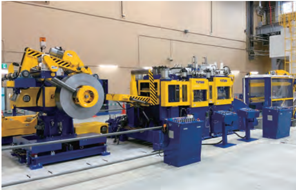
Main product coil line for blanking press